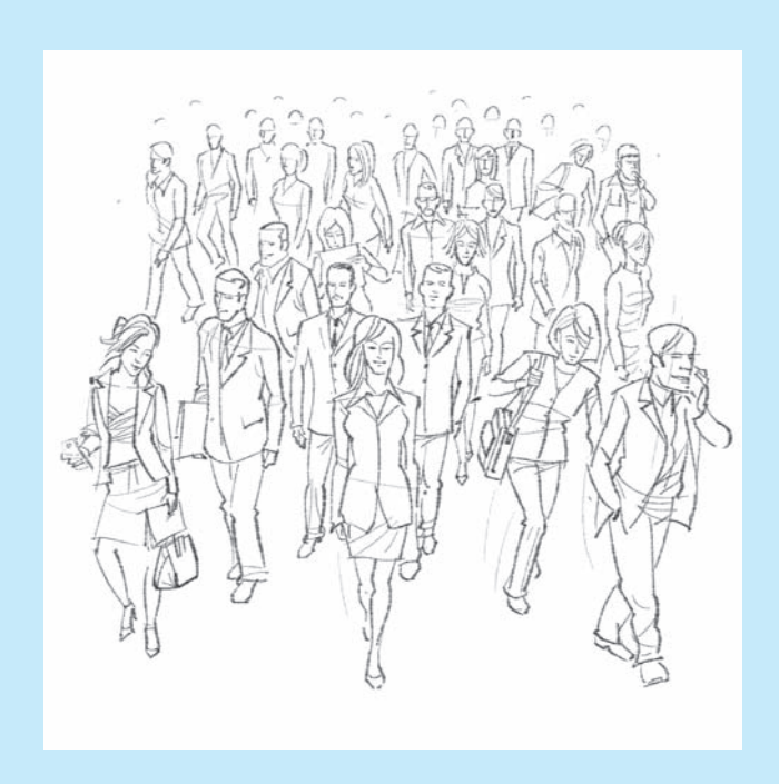
Annual Report 2010